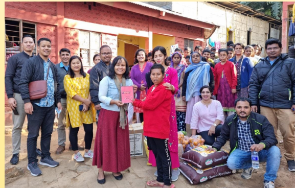
Staffs visiting Destination (left)